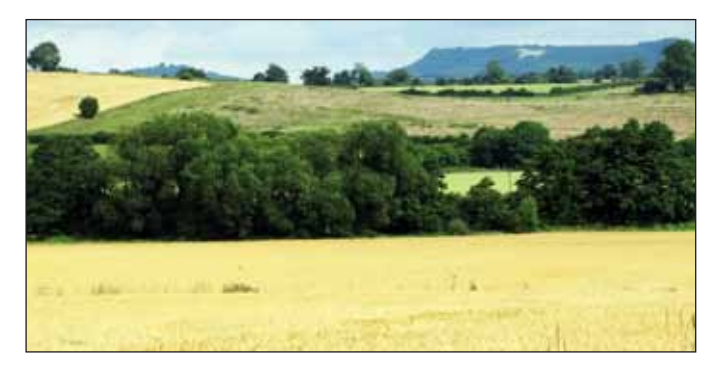
A wonderful view

Note: We will report on this year's full two day walk in the next issue