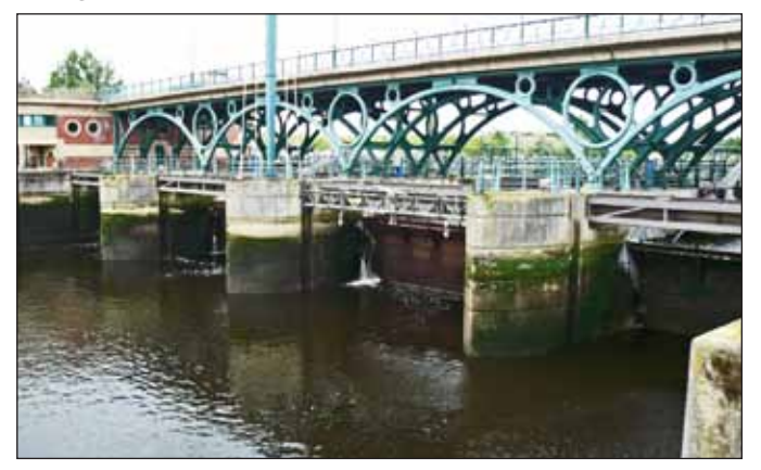
Tees Barrage helps control the Tees

Travelling to Teesside on 16 May in heavy rain, 16 members' first stop was at the Canal & River Trust's River Tees Barrage. In the Meeting Room, we learned that the Barrage was built in 1987 at a cost of £55m and was one