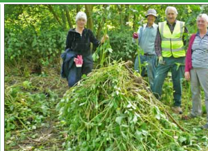
Beat the Balsam!

CYC has commissioned a public consultation exercise, "My Castle Gateway", on the regeneration project. The River Foss Society will contribute actively to this consultation, and we hope that many individual RFS members will do likewise: look out for publicity in the media over the coming months. And please share your ideas with us, so that our response to the consultation reflects members' views as much as possible.