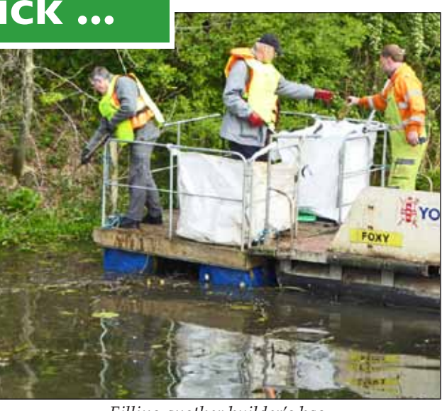
Filling another builder's bag

witness the significant environmental impact that we had made in just over two hours. We had collected two large builders' bags full of rubbish, including some 20 full bin liners as well as metal baskets and frames, wooden stakes, a road sign and two safety belts. All the rubbish was then taken off the boat/pontoon and loaded onto a flat-back CYC lorry for disposal.