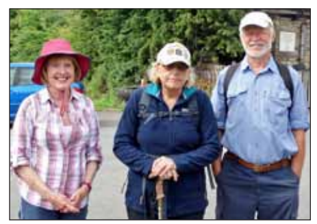
Walkers on Walk 4

and the White Horse. We continued on past Newburgh Park and into Coxwold where we enjoyed a warm welcome and a tasty lunch at the Coxwold Tea Rooms.