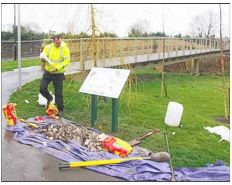
Installing the board