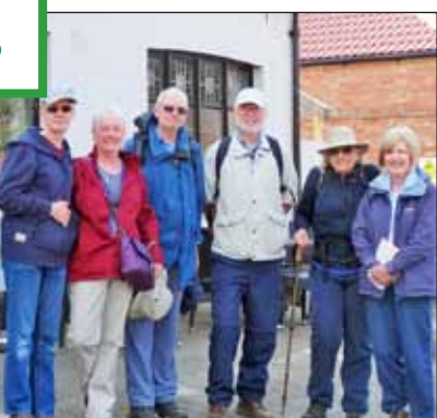
Walkers at the Half Moon Pub

On the river, we walked north along the river bank. Enjoying the day we car-