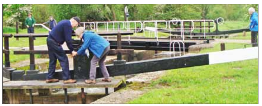
"New Horizons" in the lock at Gardham (left), where some of our members put their backs into winding up the lock gate paddle (above).