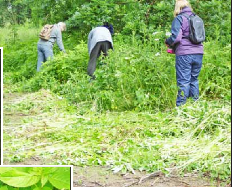
A hard-working team pulled hundreds of plants

Until other control methods are developed, the only way to try to control the plant along the Foss is to pull as much as possible before seeding. Luckily, the shallow roots make it easy to remove. We cannot remove or burn pulled plants, but doing as much pulling as we can is very important. By