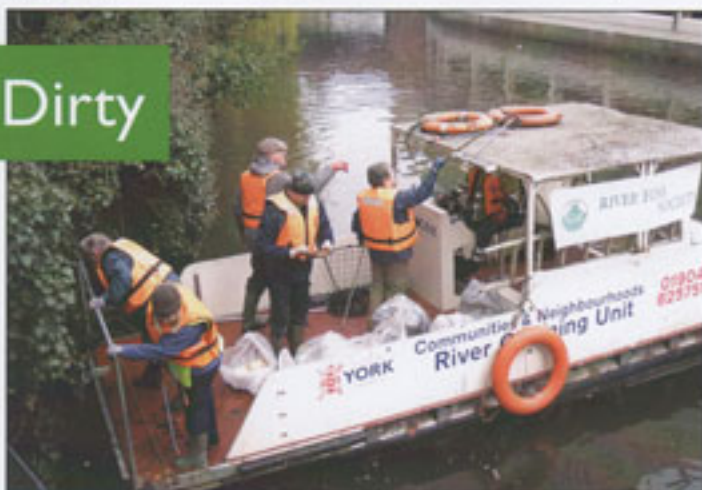
Flying the flag for River Foss Society on 24 March

Although not so many volunteers helped on 26 May, we did clear the river and banks from the foot/cycle bridge over Huntington Road downstream to Blue Bridge. Not as much litter was taken, but we did manage to clear 17 sacks, 3 life buoys, 1 wheel (again!), 1 holdall/case, a 6 ft. car section, and many other delights.