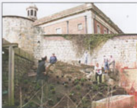
Working in the shadow of the Castle.