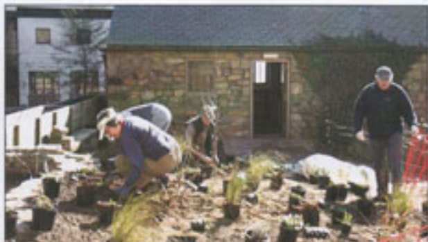
Planting the new rockery by Raindale Mill