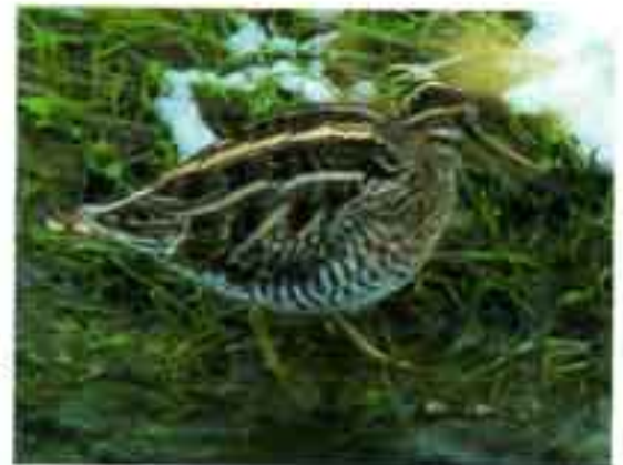
Snipe photographed on Christmas Day from Lock Cottage, New Earswick

Later, Goosander were reported at Towthorpe possibly the same birds. Snipe have also been seen near Earswick. Meanwhile the resident Kingfisher does not appear to be put off by the cold weather and has been seen frequently flying along the river near Huntington church. Three Roe Deer were seen on Strensall Common and also near the Foss at East Lilling House Farm.