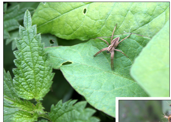
Tony photographed these jewel-like Foss residents during the autumn