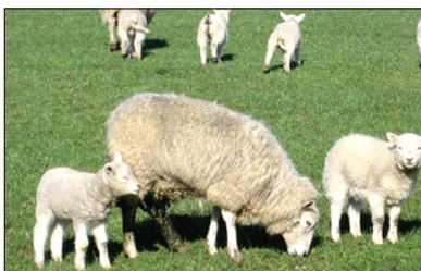
Spring lambs – a welcome sight

First Walk of 2014: Monday March 3rd. This year's walks started from Oulston. Six members joined this walk and chose well, as it was the warmest, sunniest day of the year by far – is