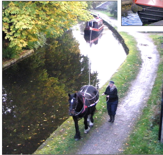
Above: Bilbo Baggins moves narrowboat 'Vixen' at a stately pace along the Rochdale Canal