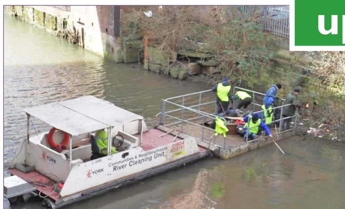
Top left: many bags were filled; top right: one volunteer worked in the nature reserve; below: the boat performs a tricky manoeuvre